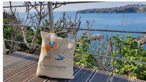
The Wall of Migrants – March 2022

It pays tribute to these men and women, to their courage and determination, to chart a new destiny for them and their families by emigrating to other countries. The names of our migrant ancestors are engraved on a plaque affixed and visible on the physical Wall, complemented by a digital Wall, making their individual stories accessible online.